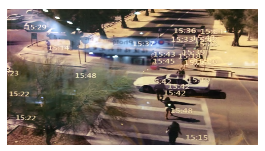
Building technology enables intelligent networking of systems. Intersec Building, the international platform for connected security, will show how.

At the beginning of 2020, the security industry was already well prepared for the Intersec Building platform. Its focus, however, was rapidly shifted to another security risk, which measures only a few micrometres: the Corona virus. A challenge to which some providers of security technology are already finding initial answers. Thus camera sensor systems, along with facial recognition, can also monitor bodily temperatures. But the technology only becomes really intelligent through networking in buildings and partially beyond. Software for this purpose can then, for instance, check how many persons are in a room and what distancing they are keeping from each other. The need for applications of this kind is definitely huge, and readiness to invest in the safety and security of staff and customers has rarely been higher.