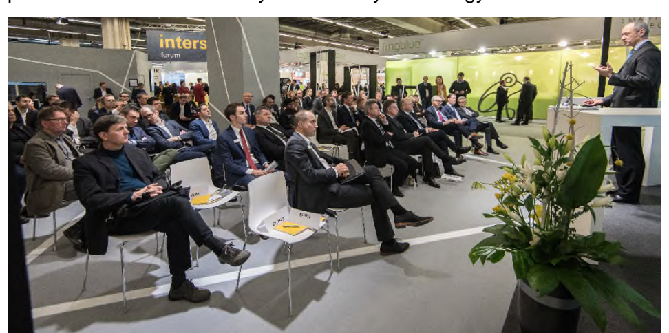
The Intersec Forum is the main information interface at Intersec Building (8 to 13 March 2020), the international platform for connected safety and security technology at Light + Building 2020.

As an important concern of manufacturers and users, connected safety and security technology will be a prominent aspect of Light + Building – the world's leading trade fair for lighting and building services technology – in March 2020. At Light + Building, leading companies covering the entire spectrum of building-services technology present, for example, emergency lighting in Hall 8 and building automation in Halls 9 and 11, as well as make contributions to 'Intersec Building', the international platform for connected safety and security technology in Hall 9.1.