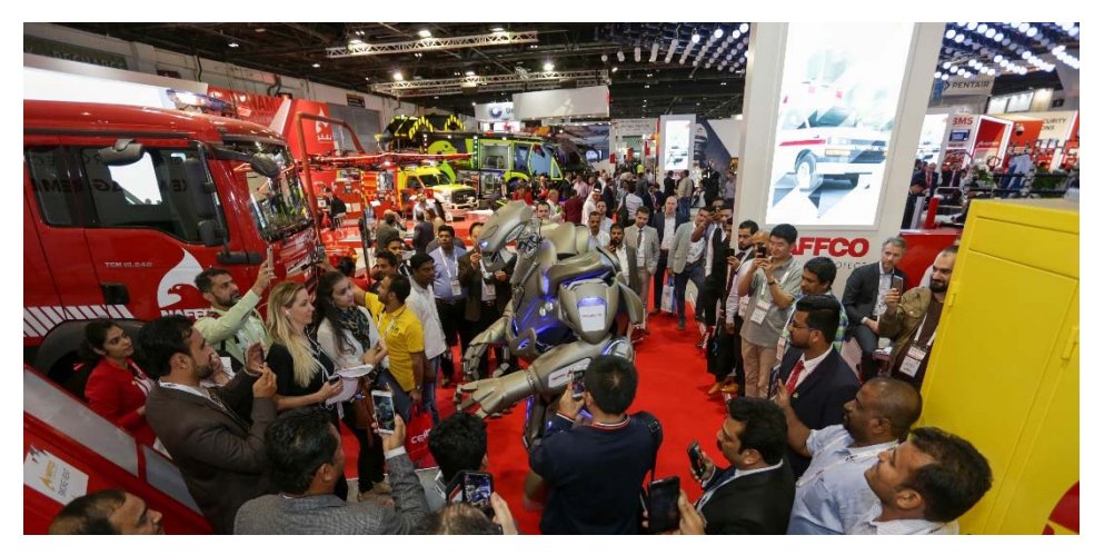
International visitors marvel at the latest technology to be seen at Intersec Dubai in January 2018

The prerequisite for this are national and international meeting places for the sector, which offer all players the chance to present innovations and to make and cultivate contacts with potent business partners. This offers them a clear competitive advantage because more and more customers are demanding complex solutions that, to a greater or lesser degree, are made up of numerous different systems.